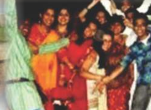
Narayana Hrudayalaya is now a Joint Commission (USA) Accredited Hospital