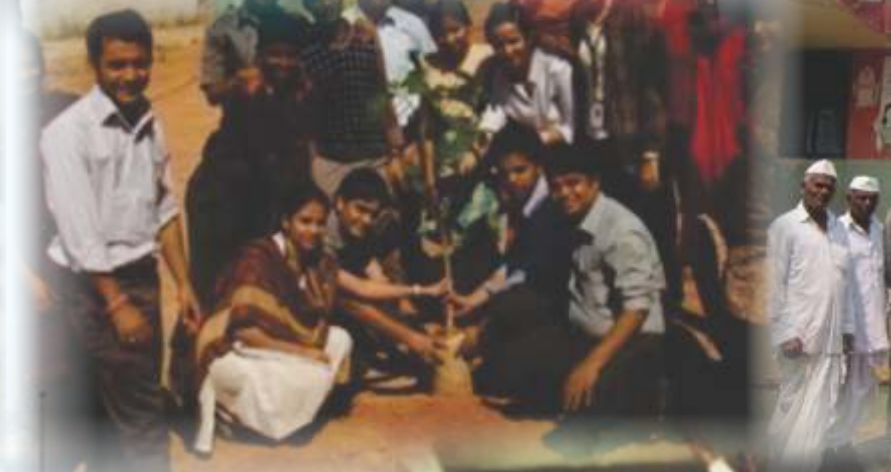
Excellence in Technical Education